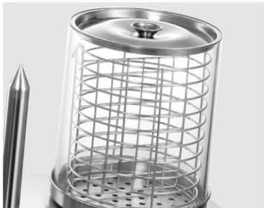
Cooked/uncooked separated Store up to 40 sausages in the 2-section basket