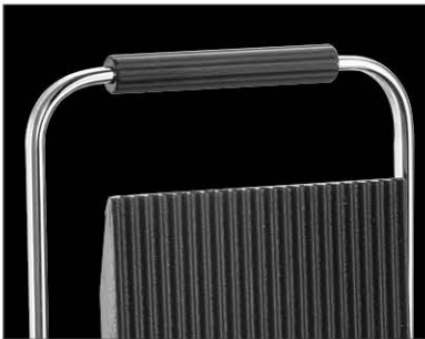
Heat-resistant handles, anti-hot and safer