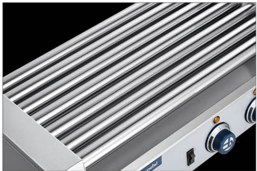
Energy saving Respectively controlled by two independent motors