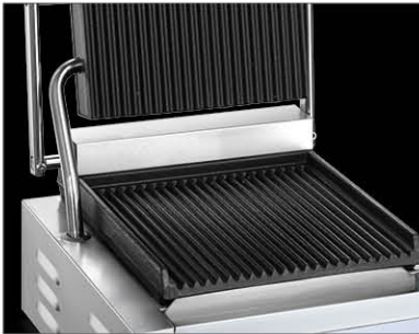
Heating elements under each plate (grooved)